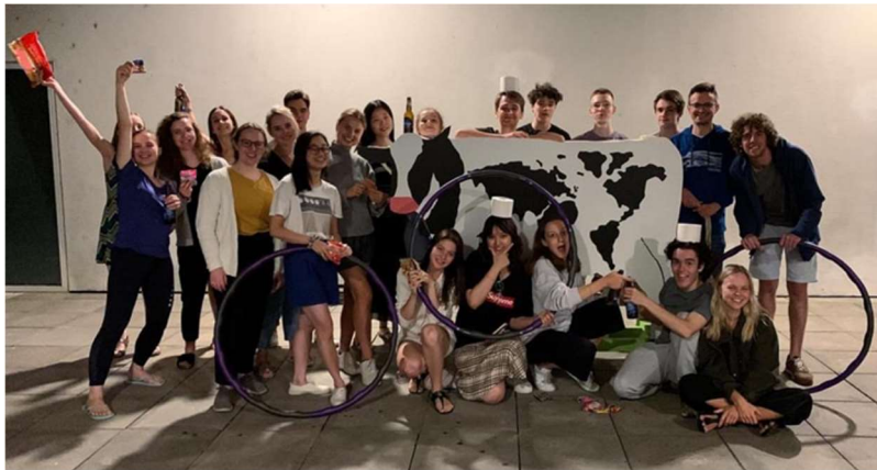
Break the Ice Party in 2022 □